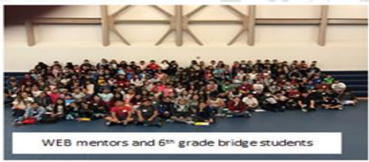
WEB mentors and 6 th grade bridge students